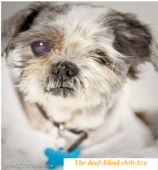
The deaf-blind shih-tzu

KM: Tell us about your most unusual shoot, any funny stories to share?