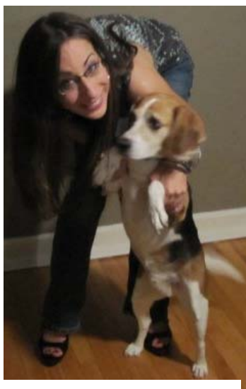
Me and my dog Patches