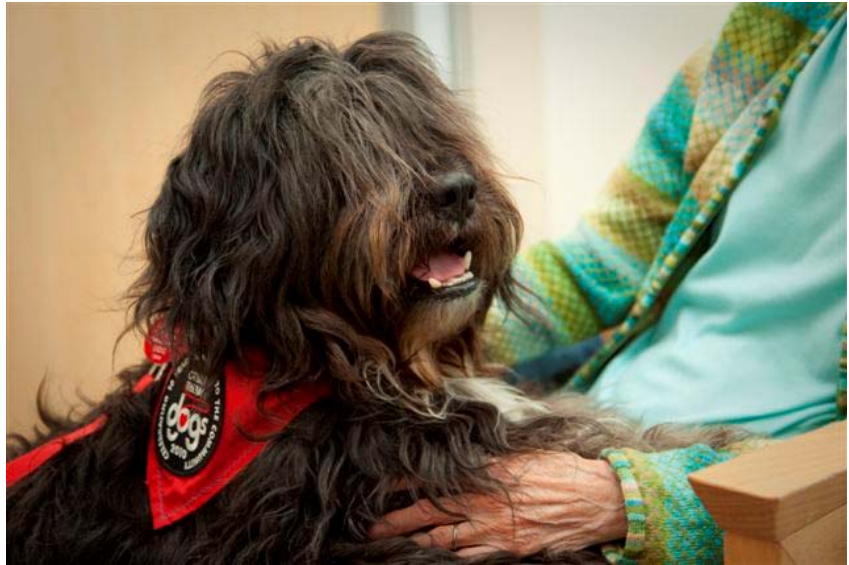
PandaRu at the ROMHC